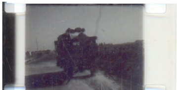
'The Fool' in the vineyards, Delano